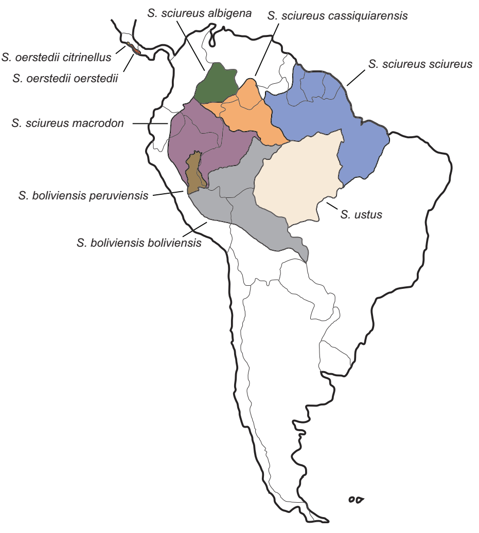
Fig. 1. Geographic distribution of four species and eight subspecies of Saimiri based on the taxonomy of Hershkovitz (1984).

Saimiri oerstedii citrinellus). In a recent analysis of mitochondrial cytochrome b sequences, Lavergne et al. (2010) identified a third clade comprising the three western Amazonian subspecies of S. sciureus (Saimiri sciureus macrodon, Saimiri sciureus cassiquiarensis, and Saimiri sciureus albigena) and a fourth clade comprising S. ustus and Saimiri sciureus collinsi, a subspecies of S. sciureus not included in Hershkovitz's (1984) classification. In their study, however, relationships among the four major clades could not be conclusively resolved.